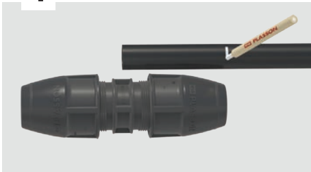
Mark pipe insertion depth