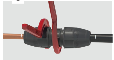
Tighten the nut