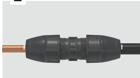
Insert the pipe